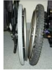
Pneumatic and outdoor tyres