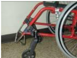
Front frame 70 degrees