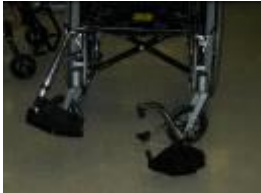
swing away removable