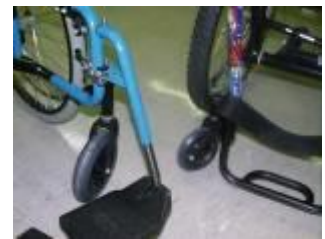
5 and 8 inch urethane caster