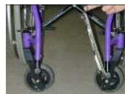
one piece lift up