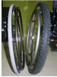
Primo and outdoor tyres