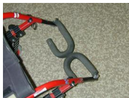
hook lift up